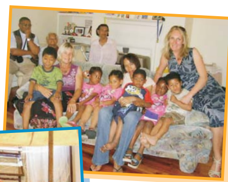
The blessing of the Goodwood house

In October, we also had the blessing of our Goodwood house, which is run in association with St Alban's Anglican Church. It was a lovely occasion at which every area of the