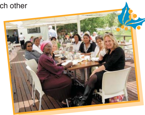
Everyone enjoying themselves at our wonderful breakfast at Spier

We at Home from Home want to thank all our House Mothers, and wish them all the best, as many of them take some much-deserved leave during this time of year.